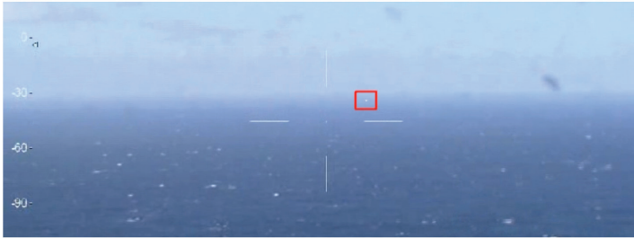
Wide Area Surveillance