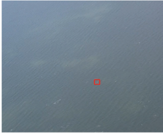
Small Target Detection