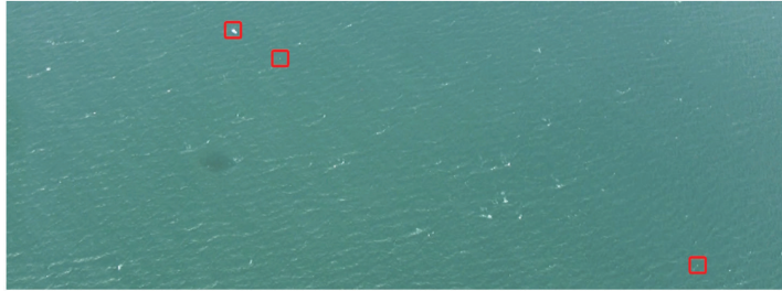
Search and Rescue